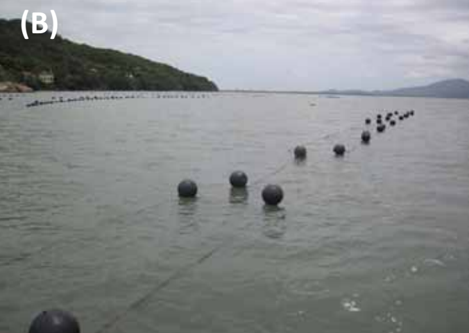
Figure 1. Flotation devices: (A) cylindrical shaped, made of PVC; (B) spherical shaped, made of recyclable polyethylene.