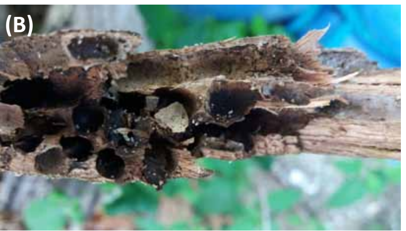
Figure 2. (A) wooden spacers (arrows) coupled to oval flotation device; (B) cross-section of a structure infested with Teredo sp.