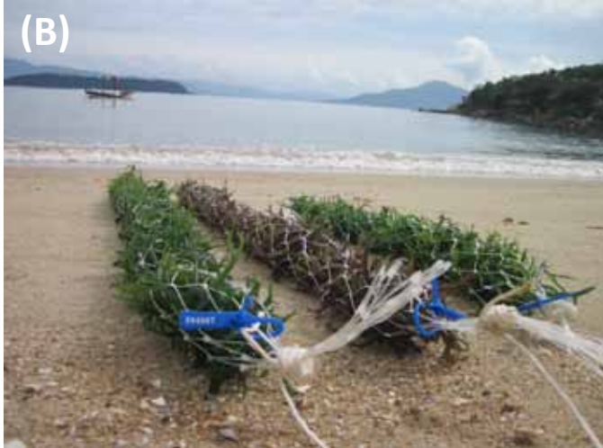
Figure 5. Field tests with the new elliptical flotation model. (A) Culture rafts spaced 5 m, with double long lines; (B) Planting of Kappaphycus alvarezii for biomass formation.